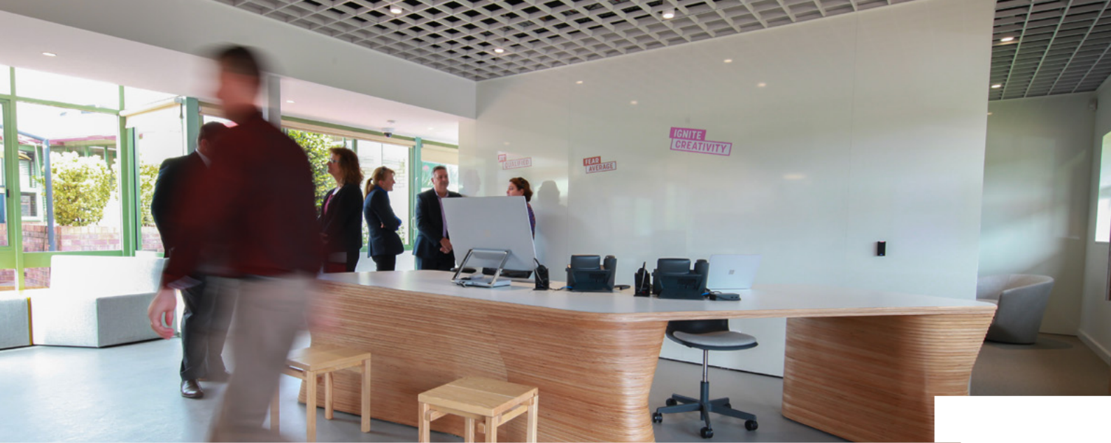
Typical layout of a CLC