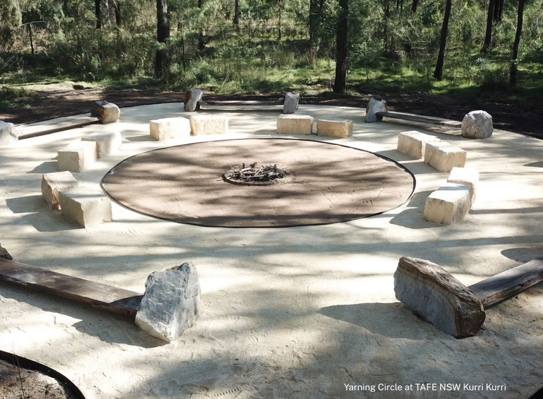
Yarning Circle at TAFE NSW Kurri Kurri